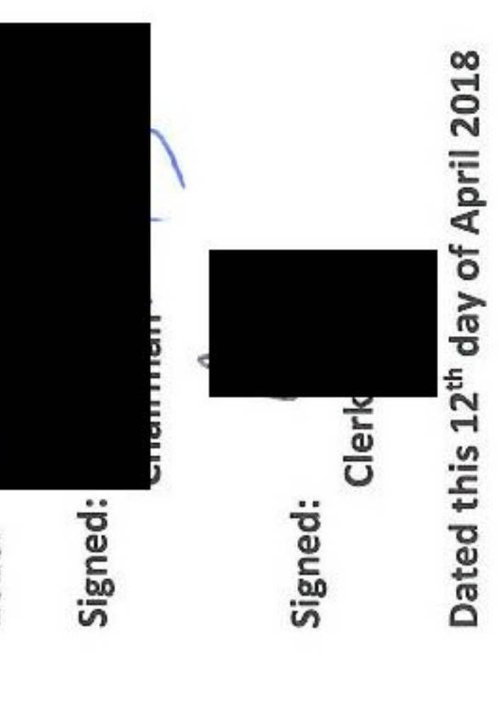
This is a true and accurate extract from the Minutes of the Parish Council meeting held on 8 March 2018.

parish not highlighted in green) appended to these Minutes be included within The Parish Council agreed that the area identified on the plan (the area of the the Stanstead Abbotts and Stanstead St Margarets Neighbourhood Plan.